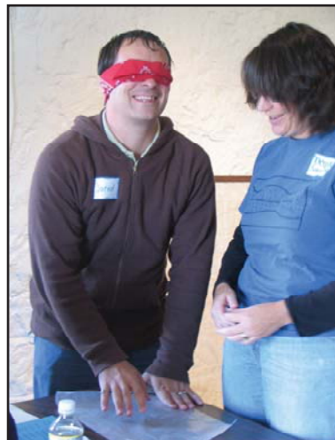
Pre-Conference workshop participants demonstrating methods for the meeting the needs of all students