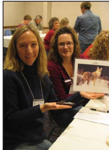
Participants receiving ideas on how to engage children in an outdoor setting