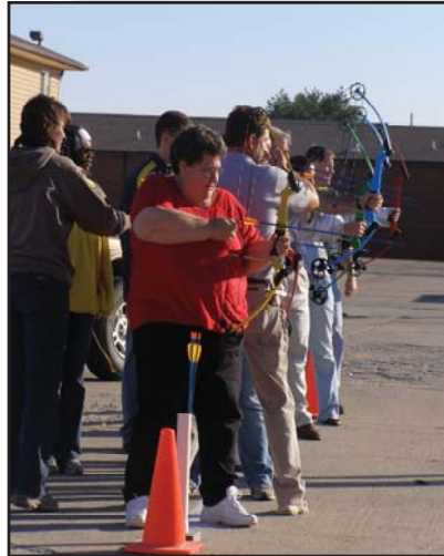
Kansas Archery in the Schools provides an opportunity for all students to succeed