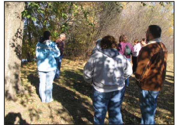
Participants toured an OWLS (Outdoor Wildlife Learning Site) at a local Elementary School