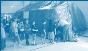
Students entering the "Soil Tunnel" constructed by the Shawnee Co Conservation District.

On September 24, 2004, in every state across the nation, children were engaged in water festivals. KACEE was proud to host the water festival event in Kansas. Accomplishments of the Topeka Water Festival include: