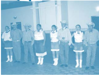
Folkloric Dance Club from the Dodge City School District performed for this year's conference participants.