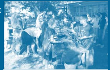
River-scaping with Streamlink